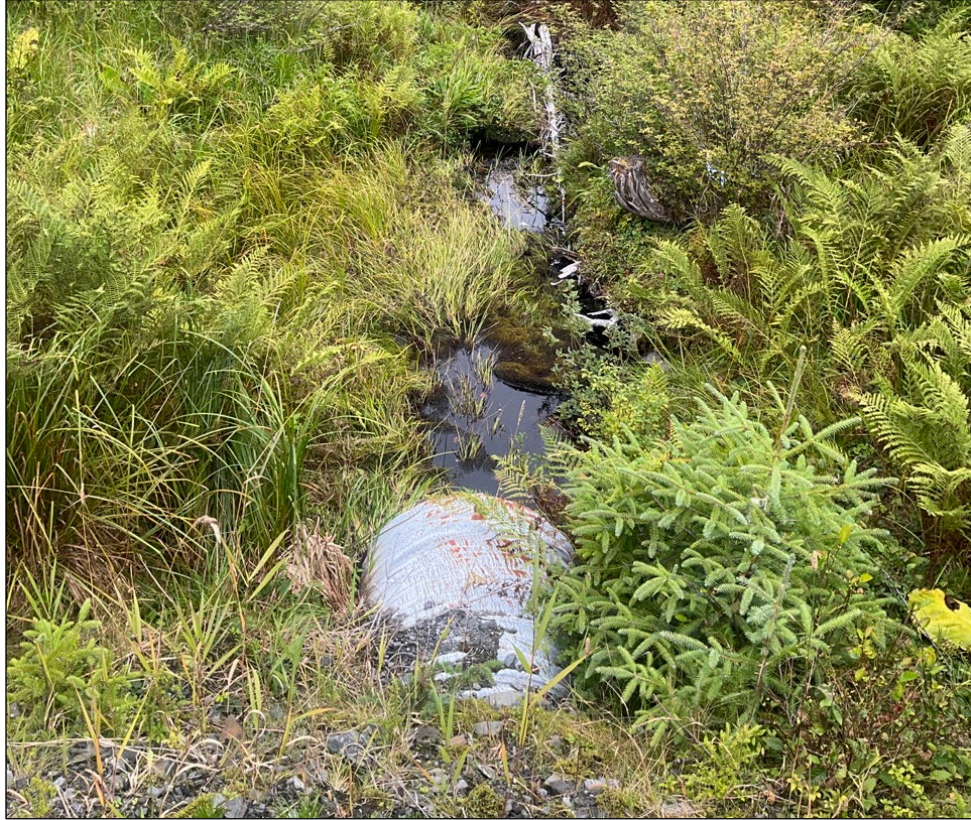
Figure 2.—Stream channel and culvert at waypoint 715.