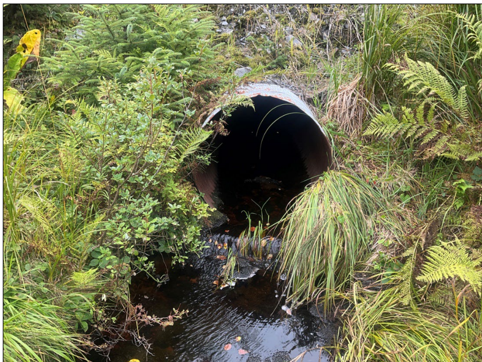
Figure 3.—Culvert at waypoint 715.