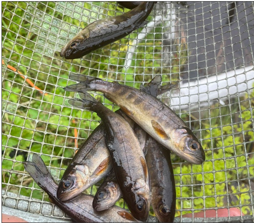
Figure 1.—Juvenile coho salmon captured at waypoint 715.